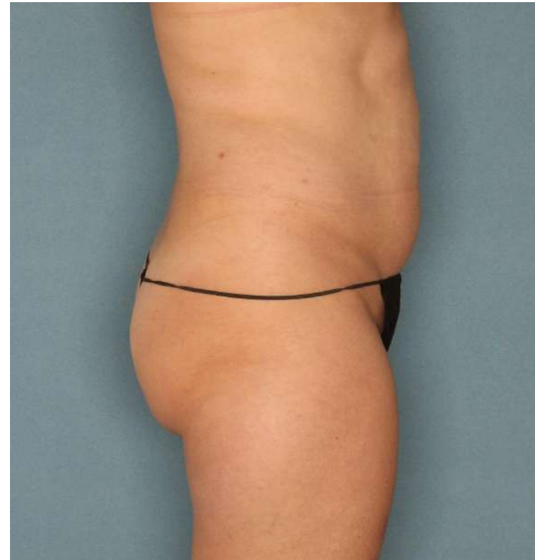
4 weeks post 1 treatment