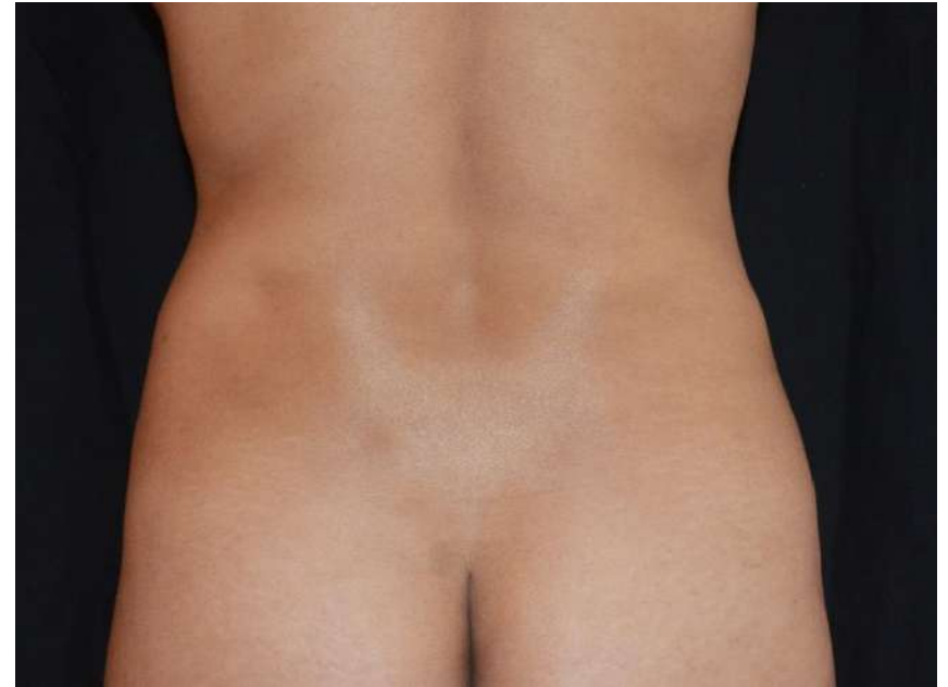
3 months post-liposuction