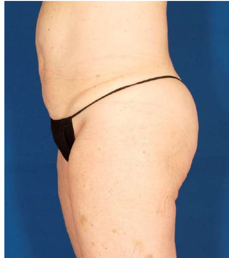
Post 1 Treatment Abdomen: -1.7cm