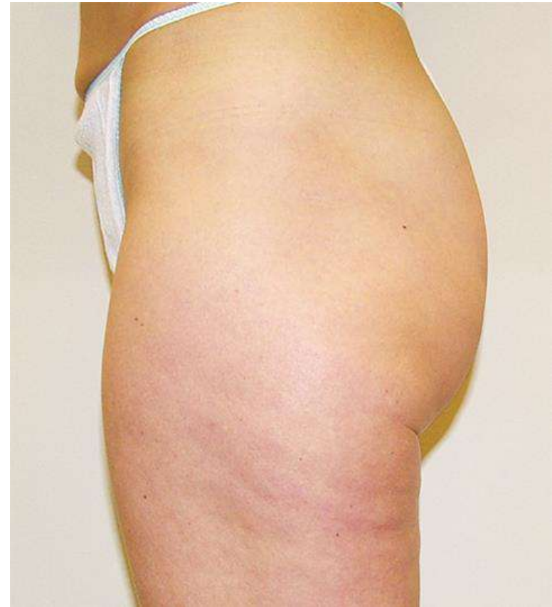
Post 3 sessions