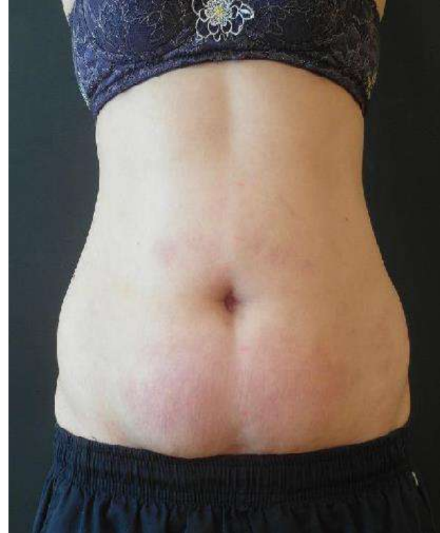
After VelaShape III and UltraShape combined protocol