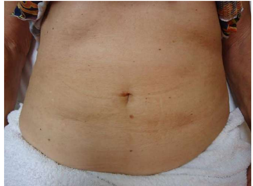
Post 4 sessions