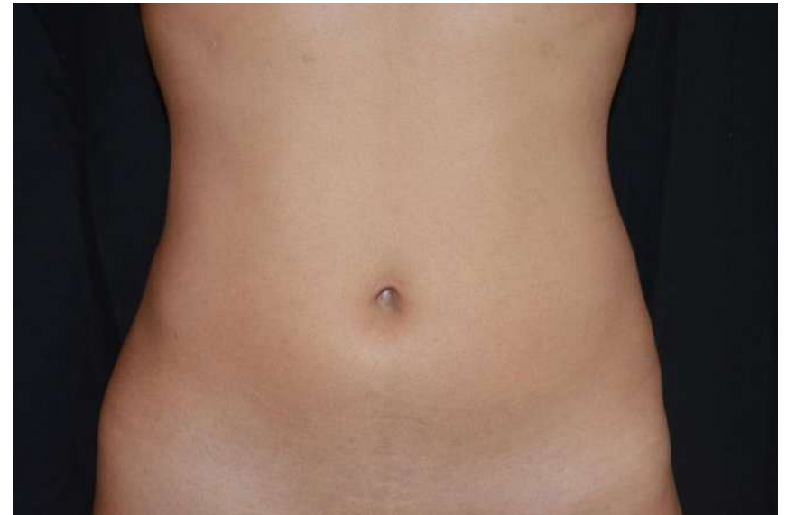
3 months post-liposuction