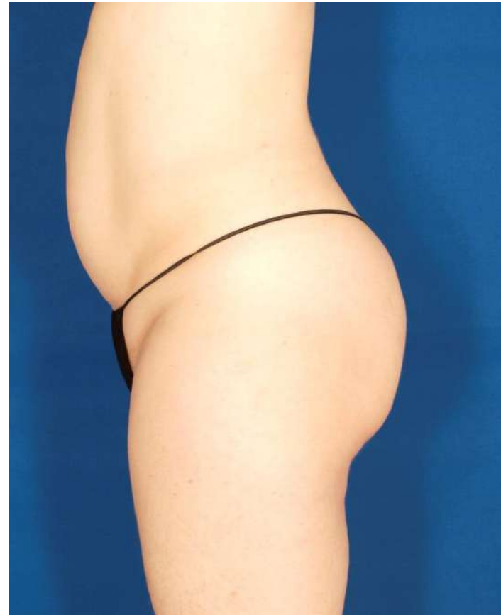
Post 4 weeks after 1 session