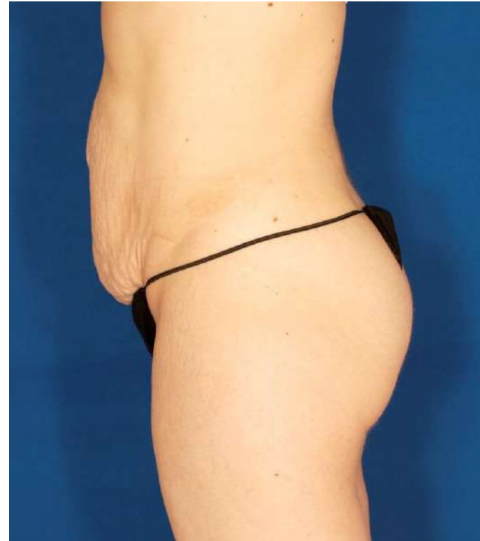
Post 1 Treatment Abdomen: -2cm