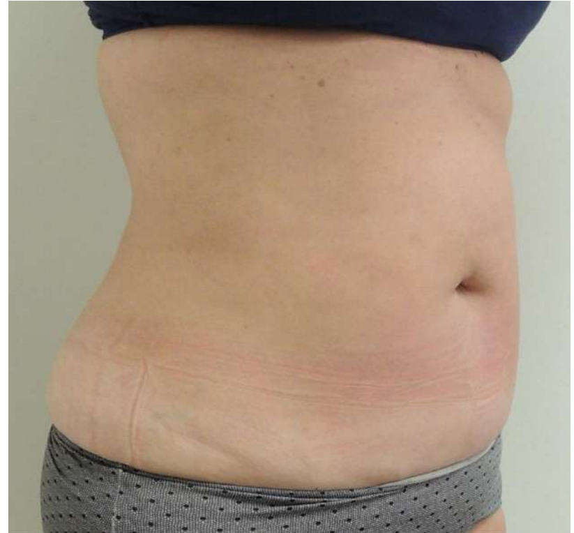
After 1 session