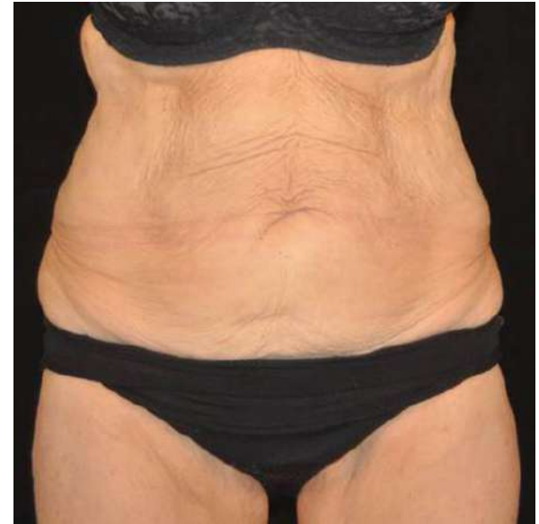
Post-Cryolipolysis + VelaShape III