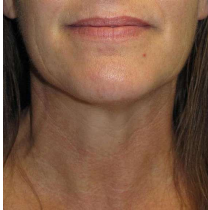
8 weeks post 3 treatments